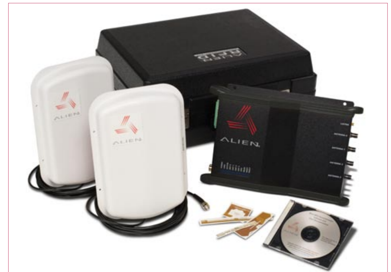
Complete Developer's Kit for Java and .Net environments

The Autonomous Mode functionality of the Alien Reader Protocol enables the reader to collect tag data when triggered by external events detected by magic eyes and other sensors. In this mode, readers are activated only when needed, thereby reducing the on-time of each reader and lowering the number of readers operating at any given moment. This simple, but powerful tool is a critical part of co-locating large numbers of readers in a single facility.